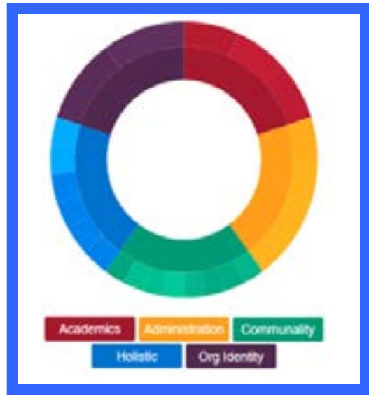
School Culture 360 ®